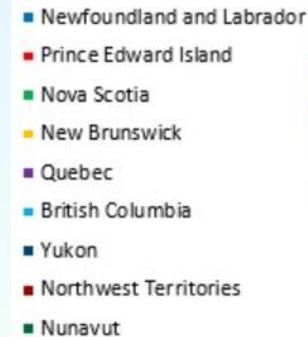
Marine Industries Direct & Spinoff GDP by province, 2018 $ billion total: 36.1